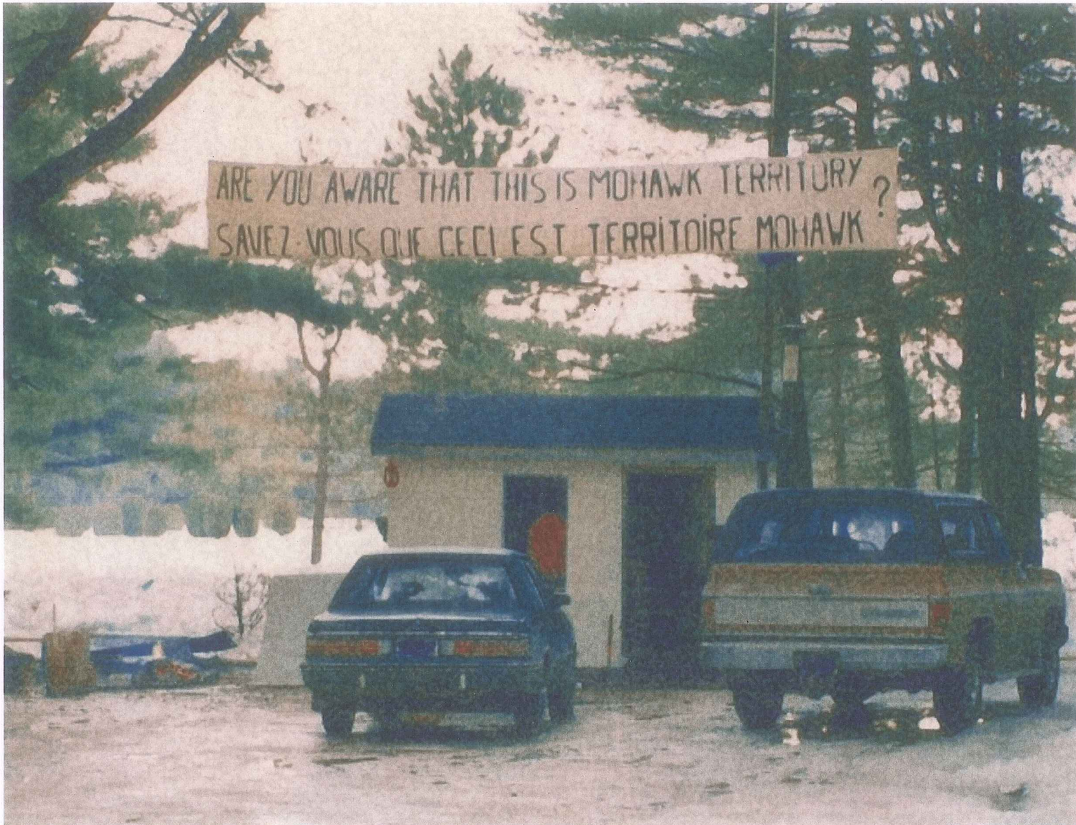
March 10, 1990, A small group of Mohawks drag a fishing shack into a clearing in the pine forest and vow to stay there, after Oka Mayor Jean Ouellette says he'll proceed with a golf-course expansion onto the disputed land.