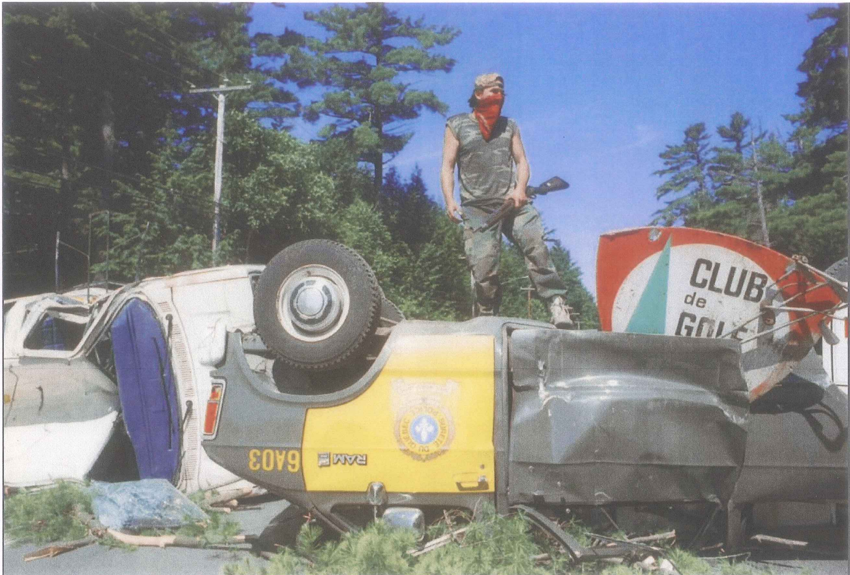
A Mohawk Warrior stands atop overturned police vehicles Wednesday, July 11, 1990, the morning of the start of the Oka Crisis in Kanasatake near Montreal. The long summer of conflict began when Quebec Provincial Police attempted to forcefully dismantle a Mohawk blockade on a side dirt road that had been erected earlier in the year to protest the proposed expansion of a golf course.