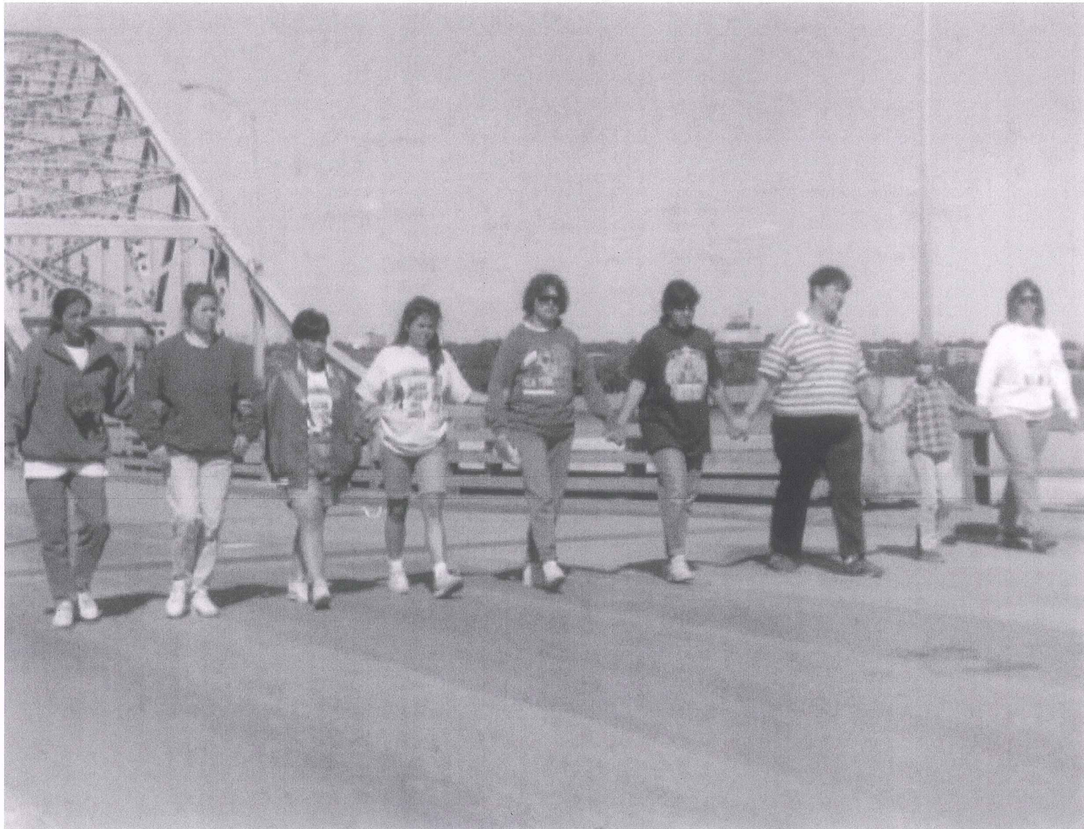
July 1990, Mohawks walk on the Mercier Bridge, which connects Montreal to Kahnawake, hours. Kahnawake Mohawks blocked the bridge as soon as they learned of the police raid in their sister community of Kanasatake.