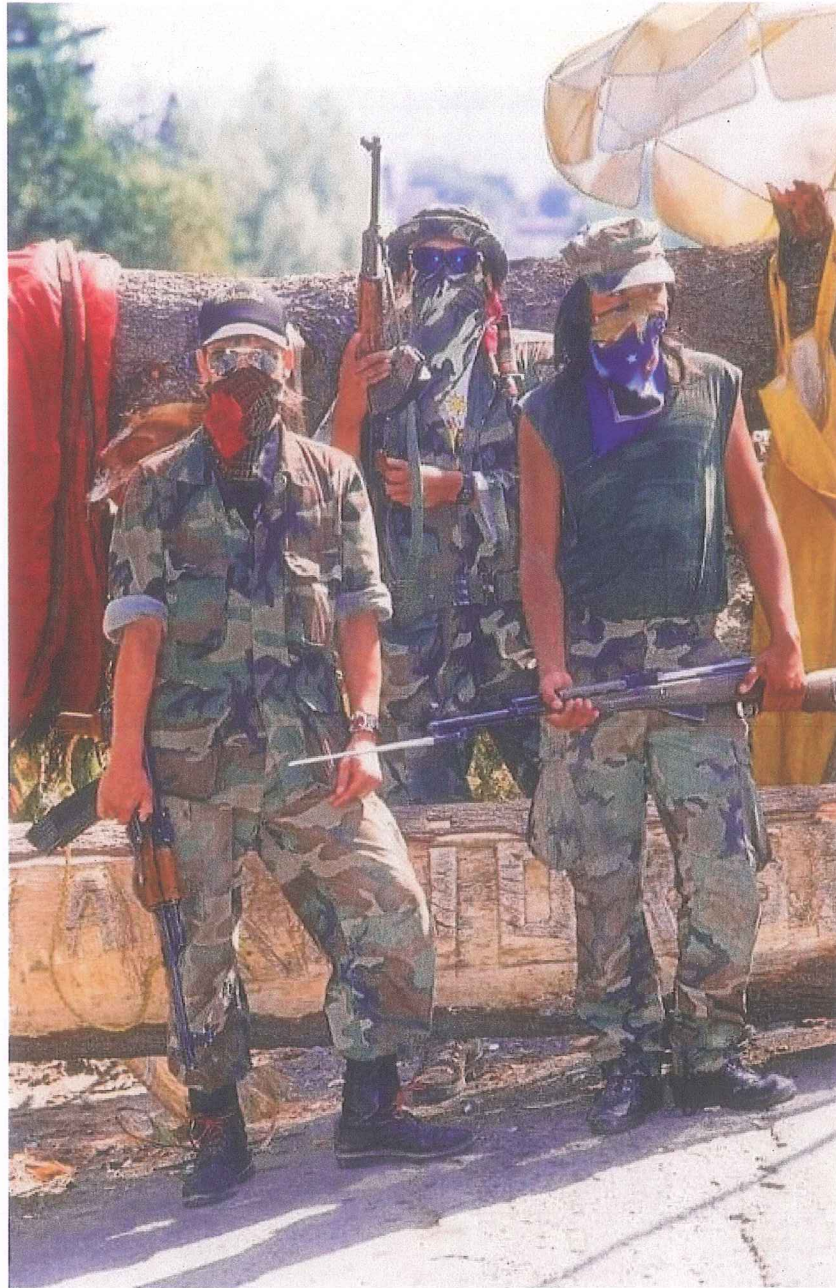
Mohawk warriors stand guard at a barricade during the Oka Crisis, 1990.