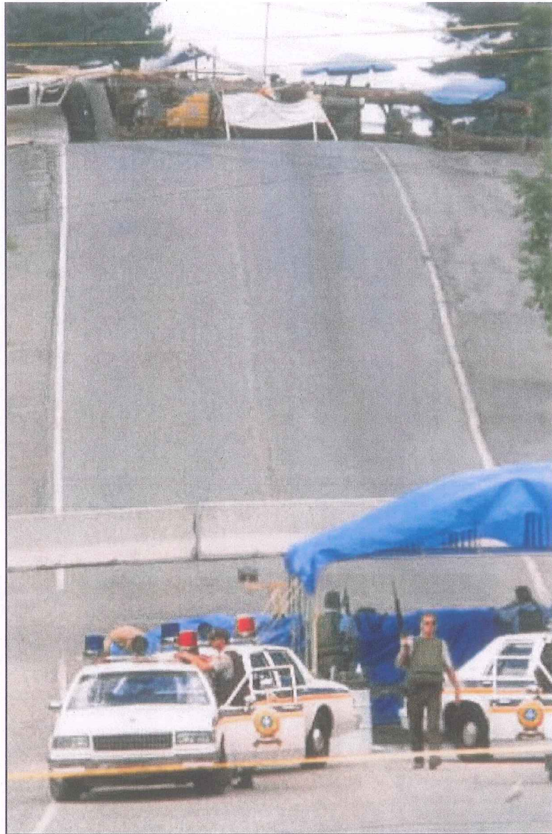
Blockade set up by Mohawks and their supporters. Local police keep a close eye on it from the bottom of highway 344.