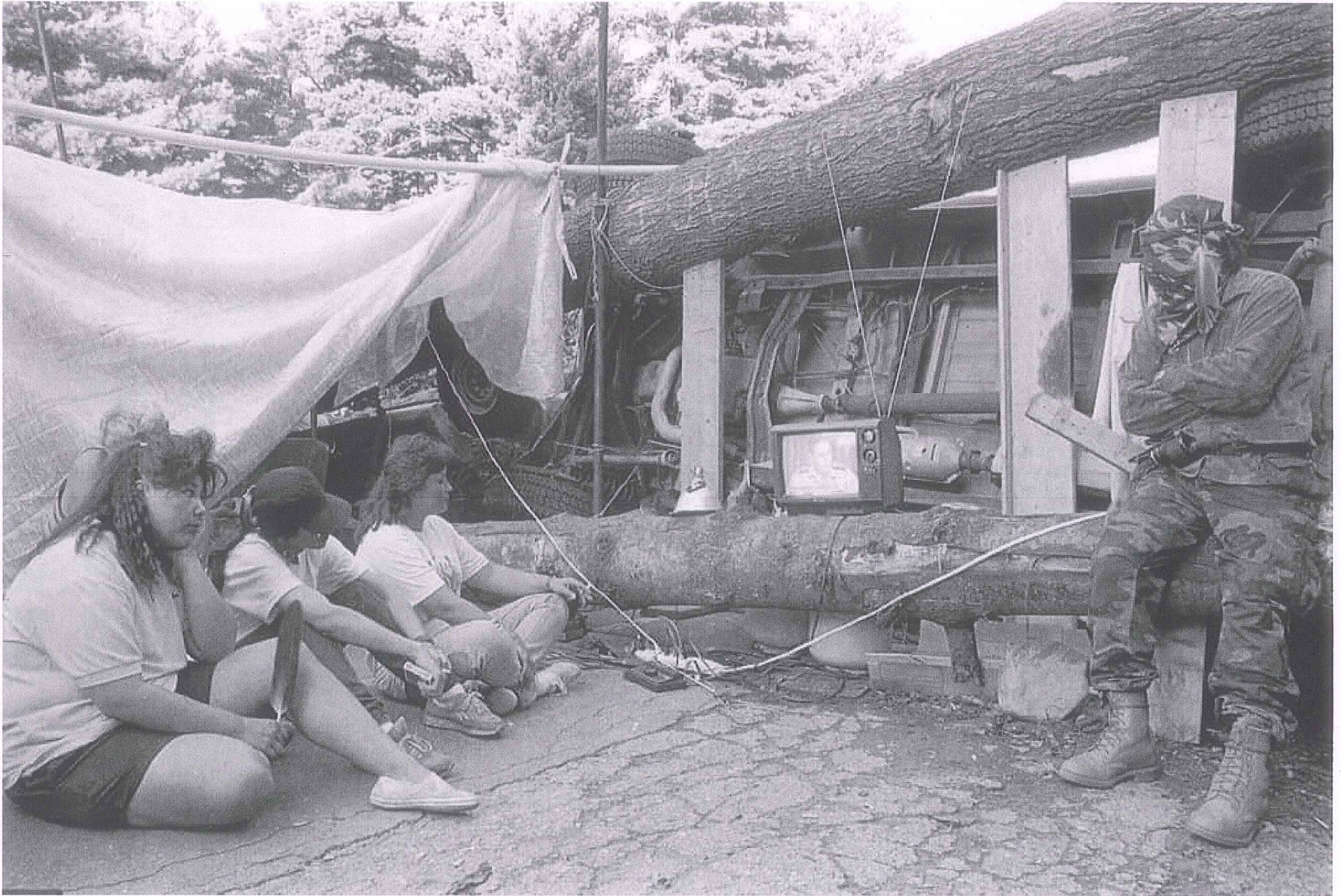
Mohawks watching Oka crisis news on barricades.