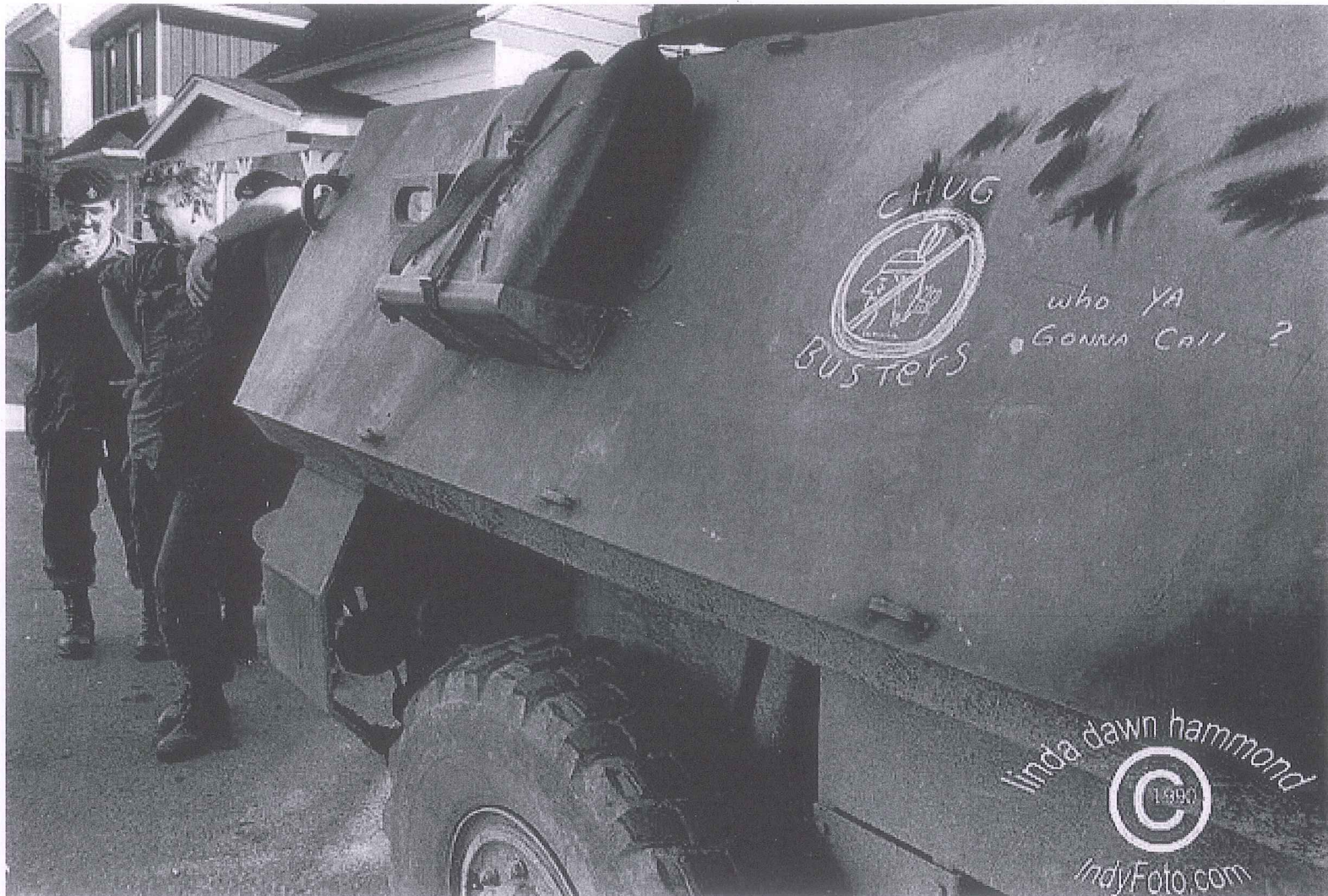
Sept. 2, 1990, Town of Oka, Quebec. "Who Ya Gonna Call? Chug Busters" Racist graffiti made by members of the Canadian Army in chalk on the side of an APC parked in the town of Oka. These Gagetown, N.B. soldiers probably regretted that they had posed for pictures munching on apples after this appeared in the Montreal Gazette the following day. As soon as I had taken it, their commander was spotted and they quickly erased it. The army had been brought in to deal with the Mohawk warriors and ostensibly to keep the situation under control after the SQ had escalated the crisis in July. There had been rumors of racism towards Natives by members of the army but until this photo appeared there had been no direct proof.