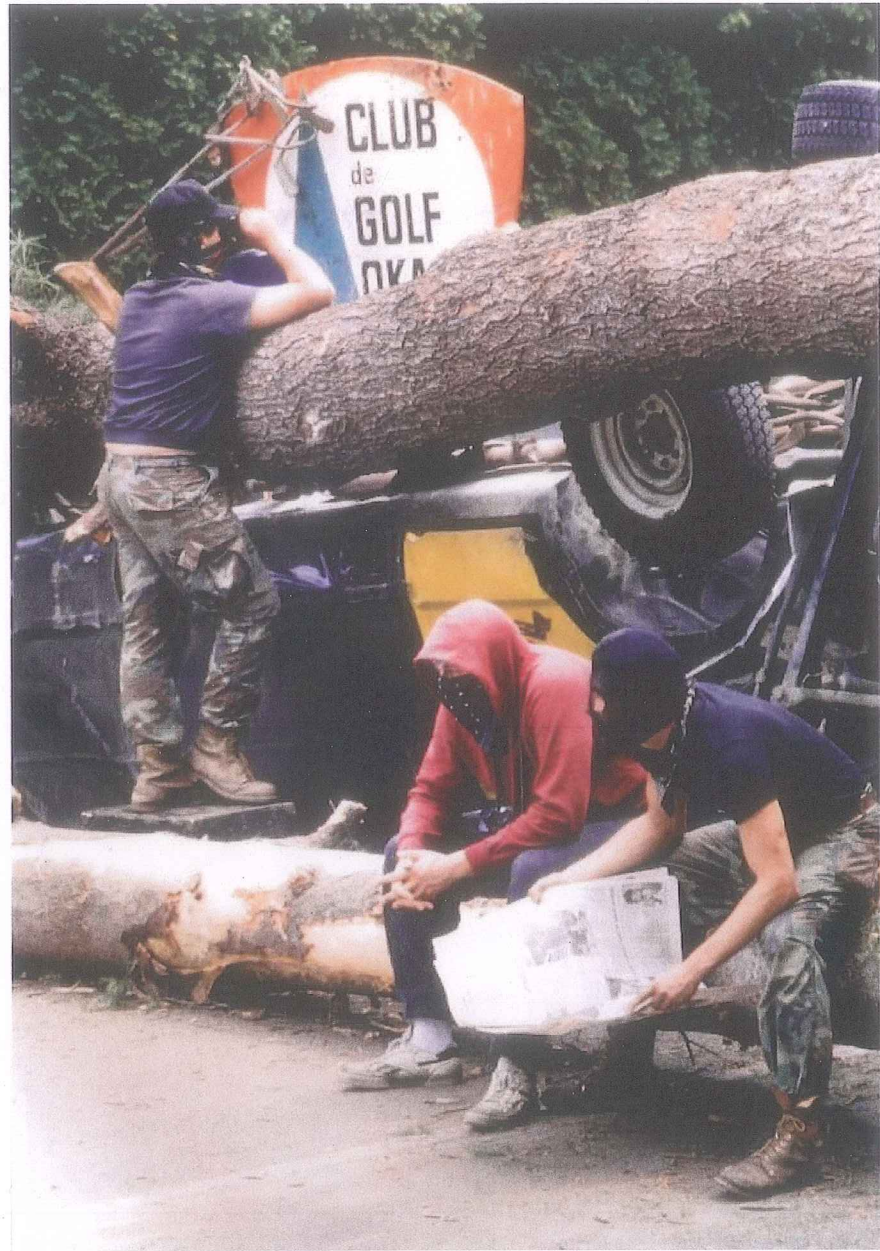
Warriors keep watch and read the newspaper at Kanesatake, 1990.