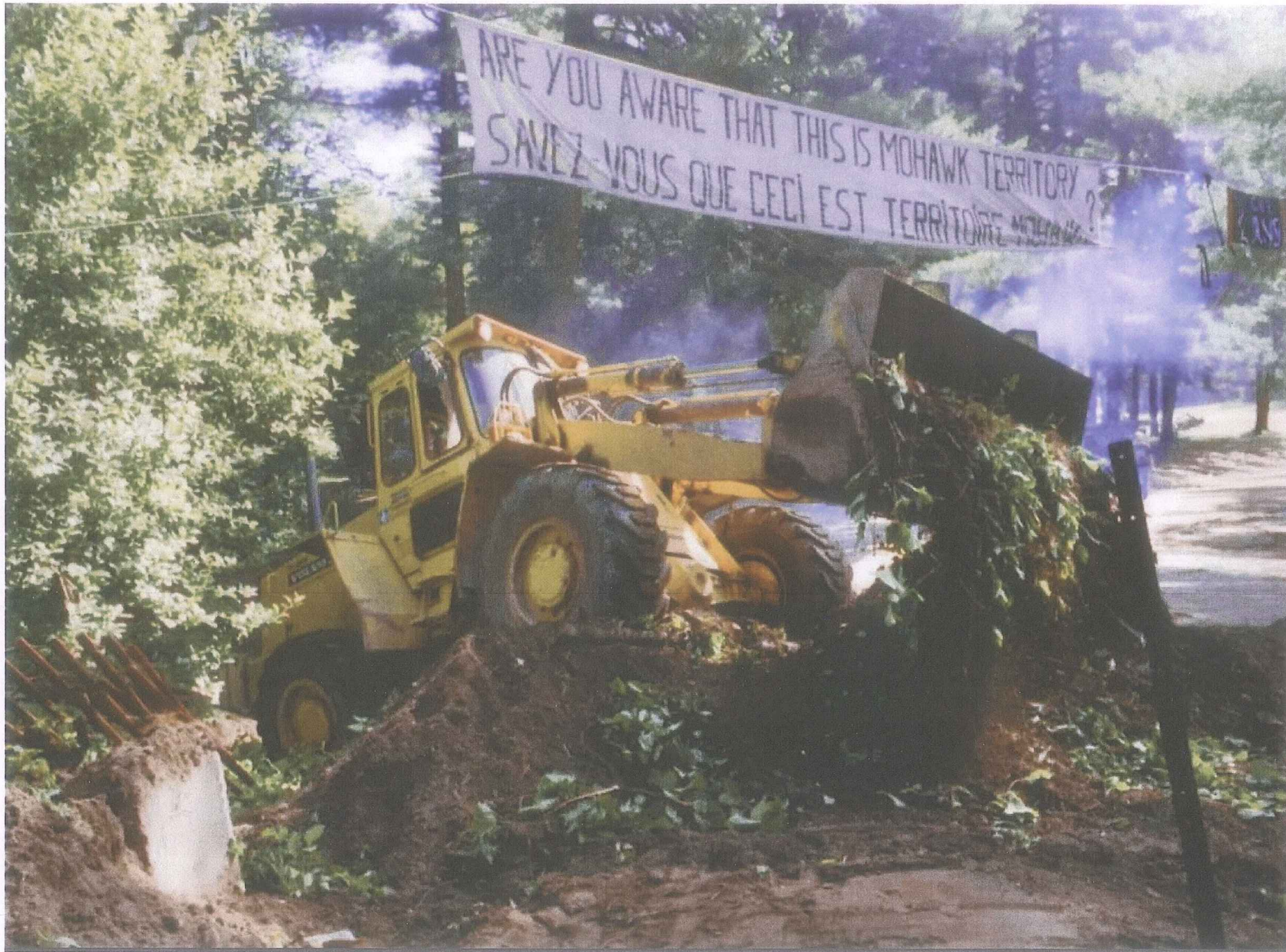
A blockade on a secondary road in Kanesatake is dismantled with a commandeered police front-end loader Wednesday, July 11, 1990, the morning of the start of the Oka Crisis in Kanesatake near Montreal. The long summer of conflict began when Quebec Provincial Police attempted to forcefully dismantle the Mohawk blockade on a side dirt road that had been erected earlier in the year to protest the proposed expansion of a golf course.