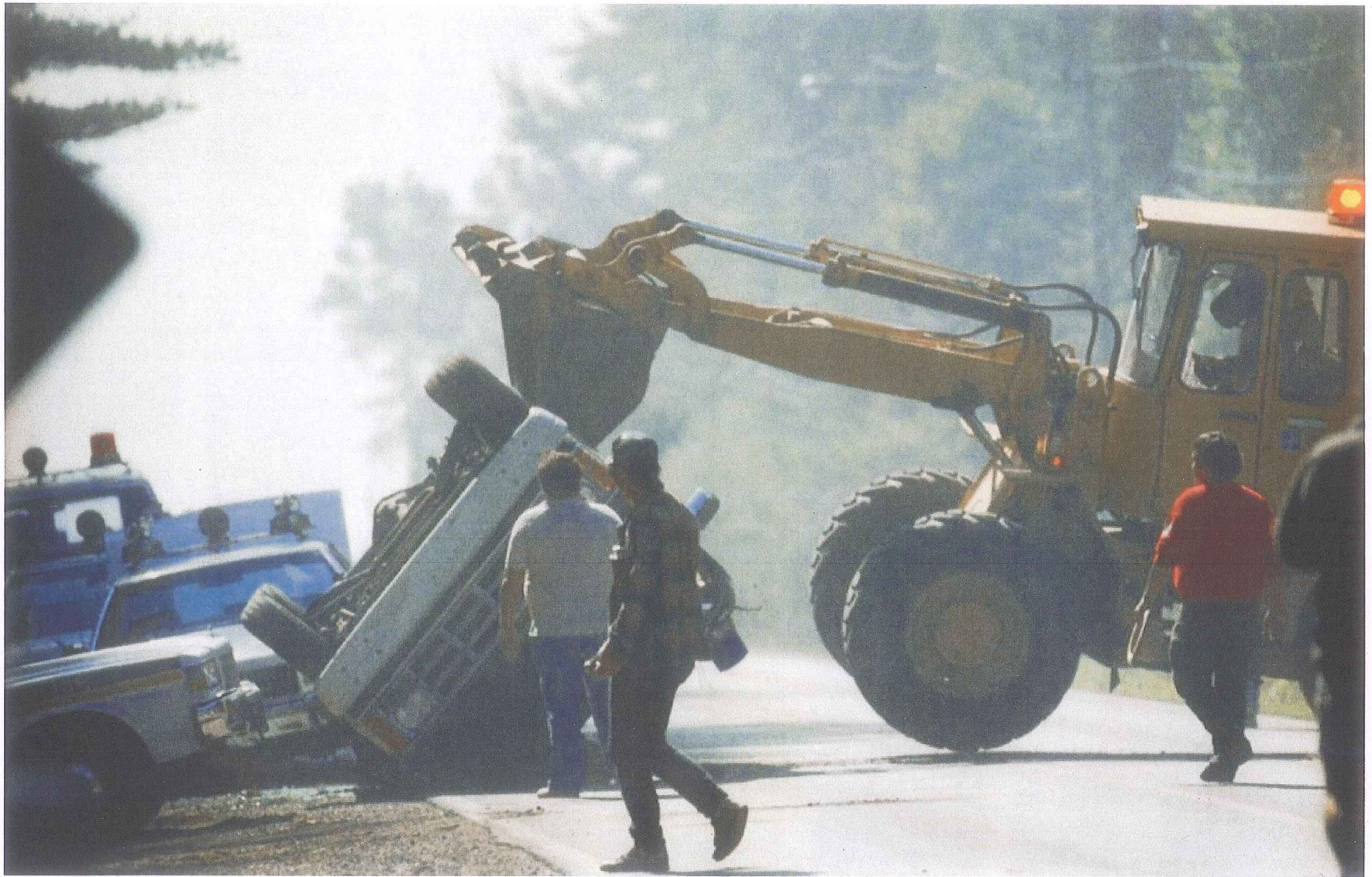
Men take part in the destruction of a police vehicle Wednesday, July 11, 1990, on the morning of the start of the Oka Crisis in Kanasatake near Montreal. The long summer of conflict began when Quebec Provincial Police attempted to forcefully dismantle a Mohawk blockade on a side dirt road that had been erected earlier in the year to protest the proposed expansion of a golf course.