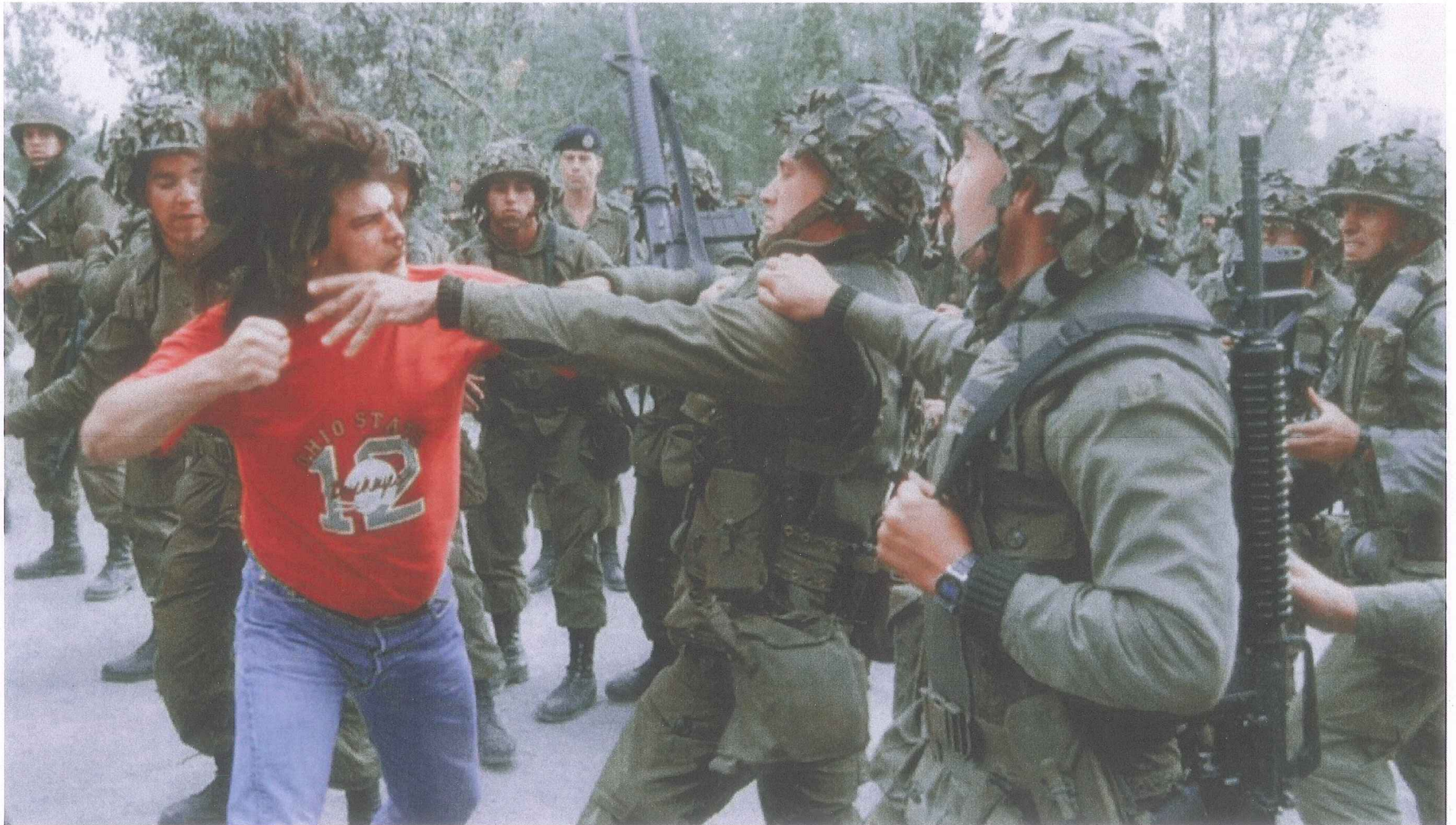
A Mohawk native winds up to punch a soldier during a fight that took place on the Kahnawake reserve on Montreal's south shore, Tuesday, Sept. 18, 1990.