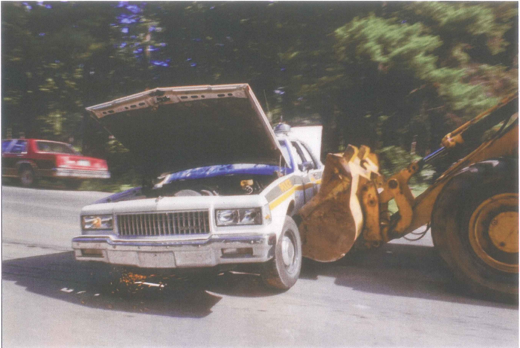
A police vehicle is pushed along highway 344 Wednesday, July 11, 1990, on the morning of the start of the Oka Crisis in Kanesatake near Montreal. The long summer of conflict began when Quebec Provincial Police attempted to forcefully dismantle a Mohawk blockade on a side dirt road that had been erected earlier in the year to protest the proposed expansion of a golf course.