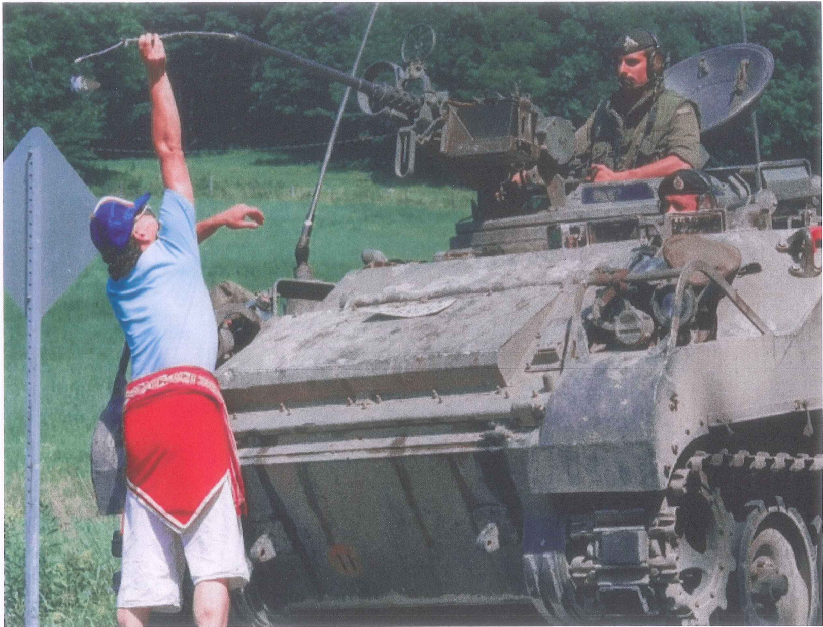
Aug. 23, 1990, A Quebec Métis places a stick with an eagle feather tied to it into the barrel of a machine gun mounted on an army armored vehicle at Oka.