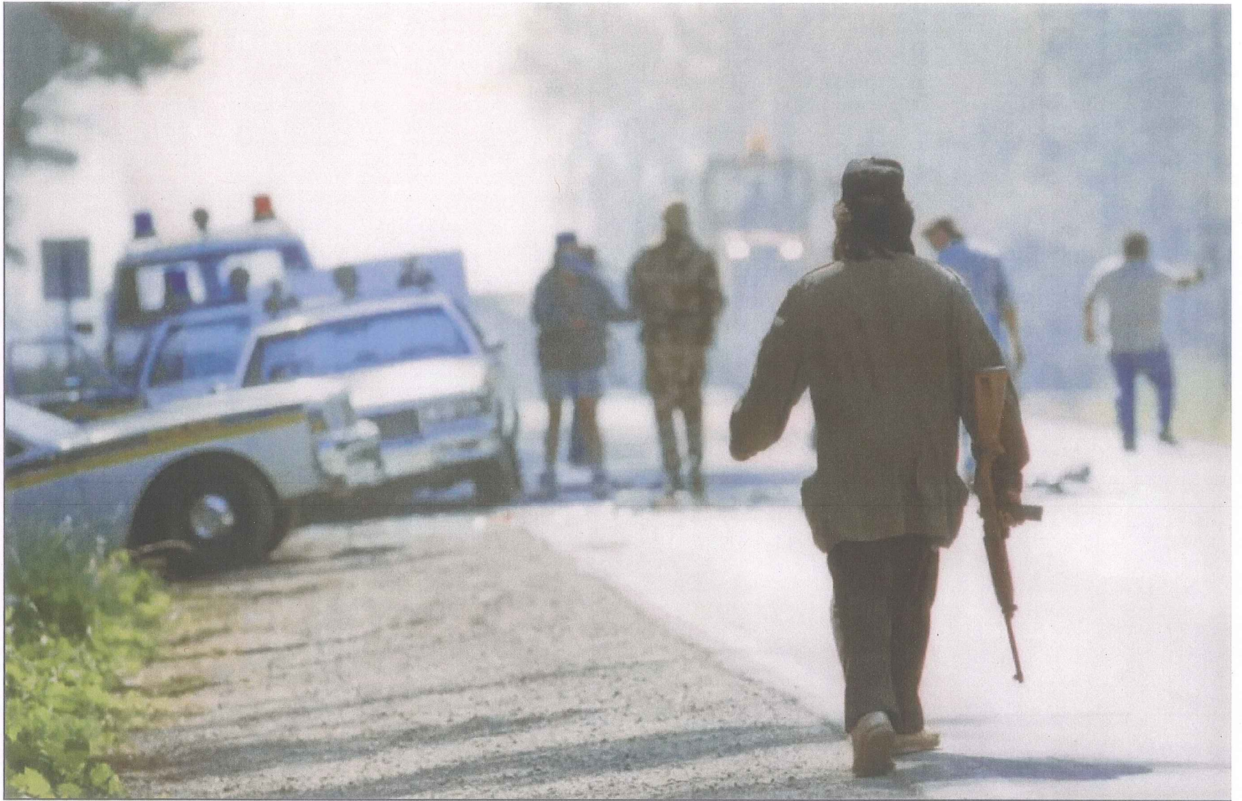
A Mohawk Warrior walks towards police vehicles deserted by the Quebec Provincial Police Wednesday, July 11, 1990, the morning of the start of the Oka Crisis in Kanesatake near Montreal. The long summer of conflict began when Quebec Provincial Police attempted to forcefully dismantle a Mohawk blockade on a side dirt road that had been erected earlier in the year to protest the proposed expansion of a golf course.