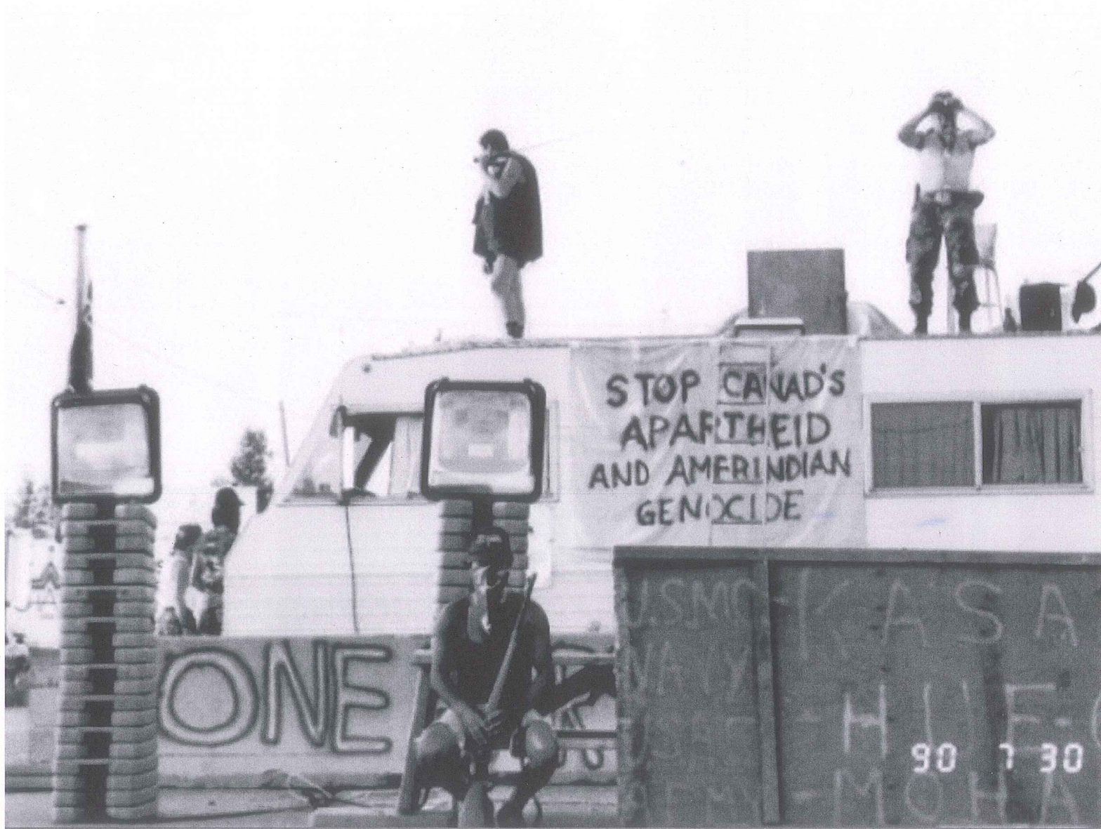
July 30, 1990, Kahnawake Mohawks keep an eye on residents of Châteauguay, who are rallying nearby to express their unhappiness with the situation in Kanesatake.