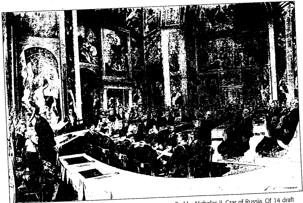
FIGURE 14.3 In 1899, The Hague Peace Conference was called by Nicholas II, Czar of Russia. Of 14 draft conventions, 12 specified rules relating to war. Procedures were developed for the peaceful settlement of disputes through mediation and arbitration.

The tension known as the Cold War between the two superpowers, the United States and the Soviet Union, dominated the world from 1945 until the Soviet Union was dismantled between 1989 and 1991. The end to this tension raised hopes of a new world order, in which all nations