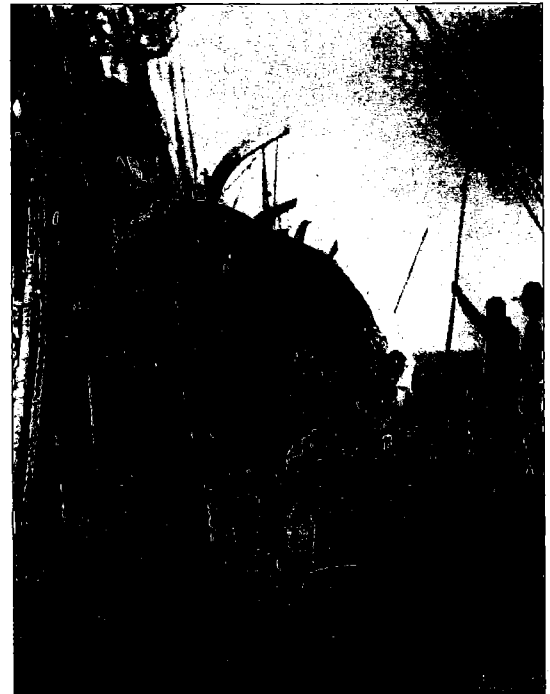
FIGURE 14.6 Japanese whalers hoisting a whale head near the Japanese coastline. When this photo was taken, around 1902, whale hunting was a major commercial activity. Today the protection and conservation of whales is a major international concern.

Critics of Japan's whale research say that whales are, in fact, being killed for parts to be sold as food in restaurants and as jewellery in boutiques. The Japanese Whaling Association