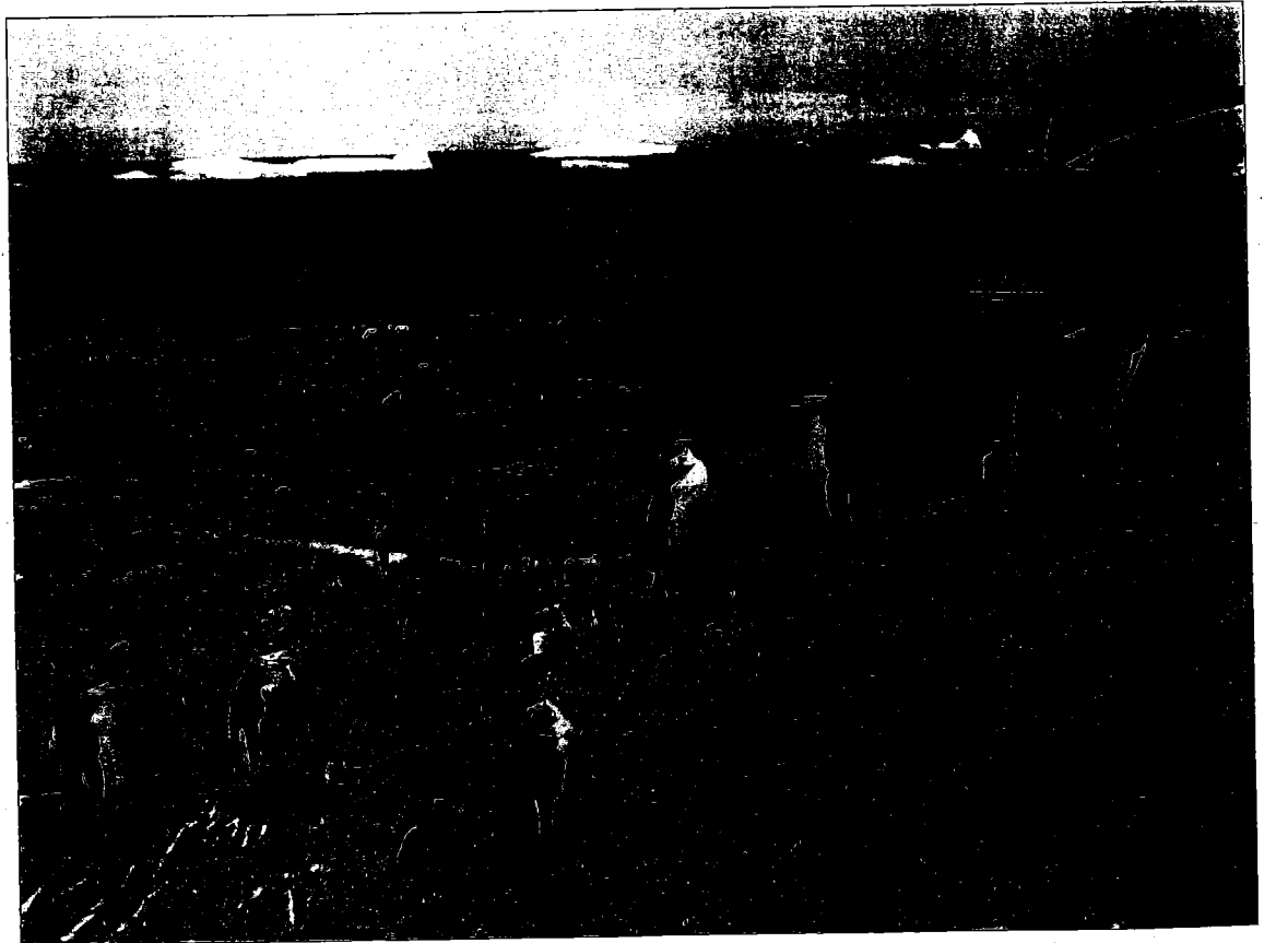
FIGURE 14.4 Although many countries would like to claim all or part of Antarctica as their own, this continent is not governed or possessed by anyone. Since 1959, treaties have attempted to promote co-operation and conservation in Antarctica.

Antarctica is a cold, windy continent that covers nearly a fifth of the world's surface. It has no native population. Most of the land is covered with ice, under which lay mineral deposits, including coal and gas, and perhaps oil and precious metals as well. As a "sovereignless land," Antarctica has been the subject of disputes among numerous nations, each of which has claimed some interest in the region. Beyond these nations, some other groups in society have