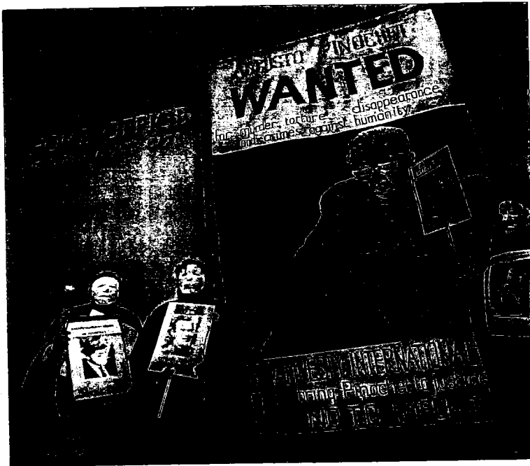
FIGURE 14.9 Pinochet argued that he should be shielded from prosecution because he was the head of state when his alleged crimes were committed. Do you agree that heads of state should never face criminal prosecution? What are the potential implications of this diplomatic immunity?

to have Pinochet examined to see if he was medically fit to stand trial.