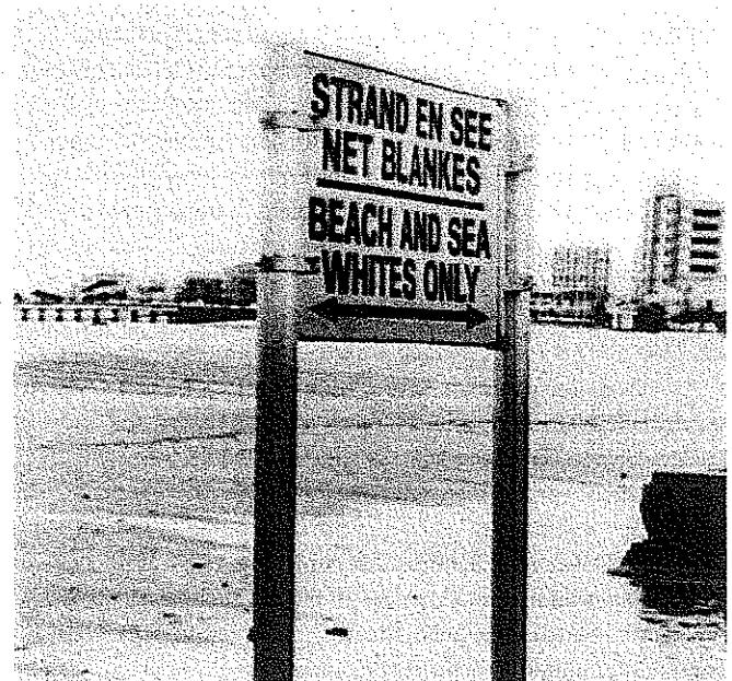
3. The legal enforcement of racial segregation and discrimination reached its high-water mark in apartheid South Africa.

The general view, however, is that compliance with Fuller's eight 'desiderata' certifies only that the legal system functions effectively, and hence, since this cannot be a moral criterion, an evil regime might just as easily satisfy the test. Indeed, it is arguable that, in pursuit of efficacy, a wicked legal system might actually seek to fulfil Fuller's principles. Certainly, the rulers of apartheid South Africa