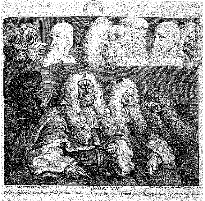
5. Bentham regarded English judges as partial, corrupt, and capricious.

The indeterminacy of the common law, he argued, is endemic. Unwritten law is intrinsically vague and uncertain. It cannot provide a reliable, public standard which can reasonably be