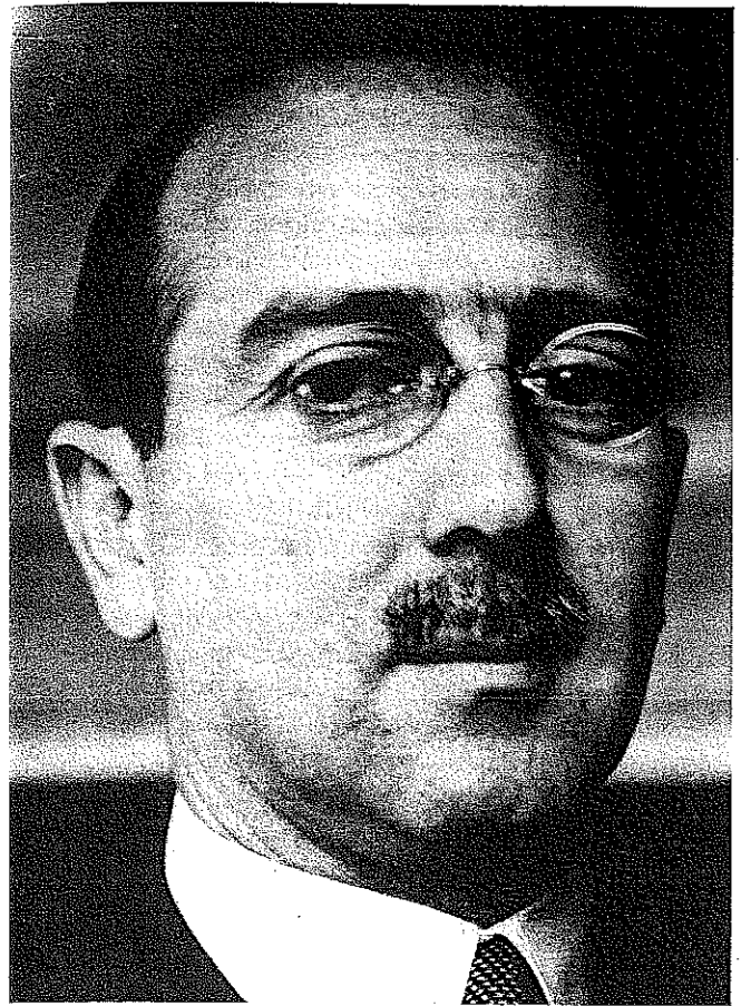
7. Hans Kelsen attempted the ethical cleansing of legal theory.

Influenced by the great 18th-century philosopher, Immanuel Kant, Kelsen accepts that we can understand objective reality only by the application of certain formal categories like time and space that do not 'exist' in nature: we use them in order to make sense of the world. Similarly, to understand 'the law' we need formal categories, such as the basic norm – or Grundnorm – which, as its name suggests, lies at the base of any legal system (see below). Legal theory, argues Kelsen, is no less a science than physics or chemistry. Thus we need to disinfect the law of the impurities of morality, psychology, sociology, and political theory. He thus propounds a sort of ethical cleansing under which our analysis is directed to the norms of positive law: those 'oughts' that declare that if certain conduct (X) is performed, then a sanction (Y) should be applied by an official to the offender. His 'pure' theory thus excludes that which we cannot objectively know, including law's moral, social, or political functions. Law has but one purpose: the monopolization of force.